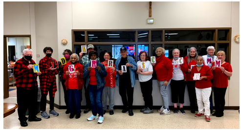
Convent Senior Center Valentine Party