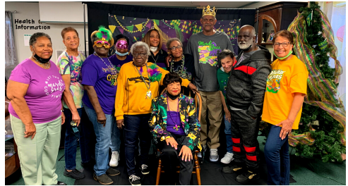
Welcome Senior Center Mardi Gras