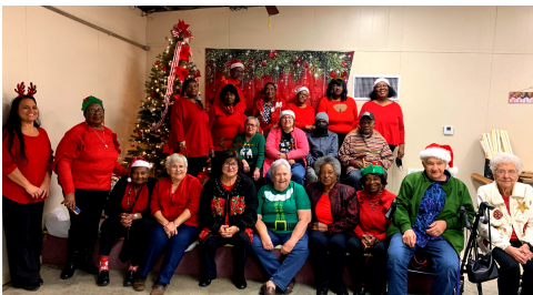
Vacherie Senior Center Christmas Party