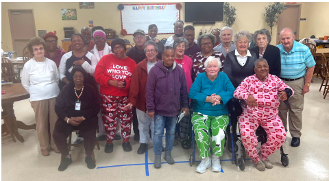
Lutcher Senior Center Pajama Party